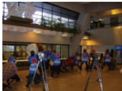
At the drum donation ceremony, U of L