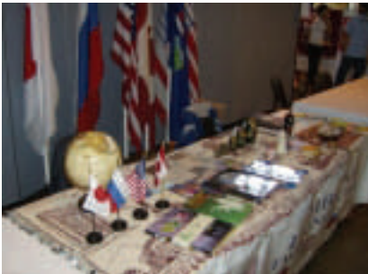
Volunteer fair—LTS table, September, 2008