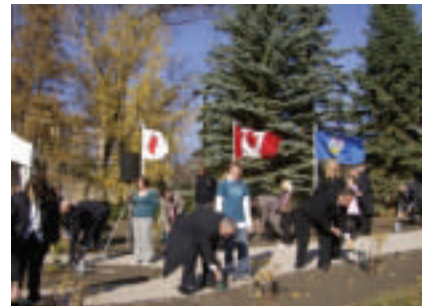
Dedication ceremony tree-planting, Edmonton, 2008