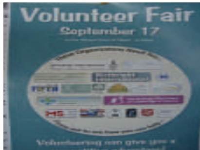
Volunteer Fair poster showing LTS as a participant, September, 2008