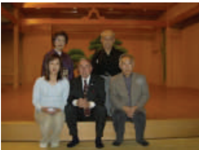
Towada City, Japan, November 2008