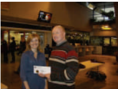
At the drum donation ceremony, U of L