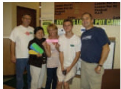
Bingo Fundraising 2008