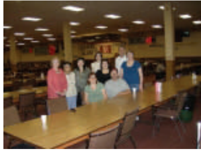
Bingo Fundraising !