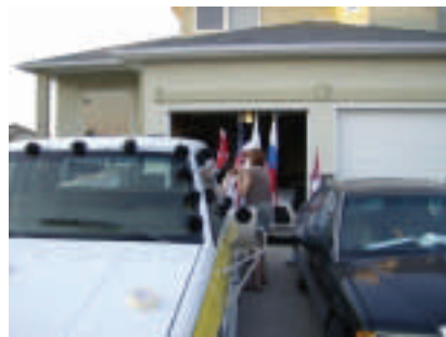
Getting ready for the Whoop-Up days parade, 2008