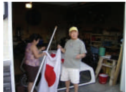
Getting ready for the Whoop-Up days parade, 2008