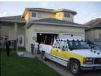
Getting ready for the Whoop-Up days parade, 2008