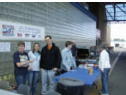
Bar-B-que fundraiser in front of Save-On Foods