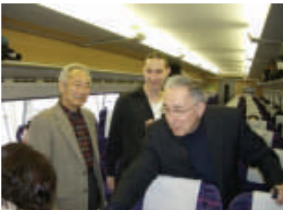
Aboard the "Shinkansen" bullet train in Towada City