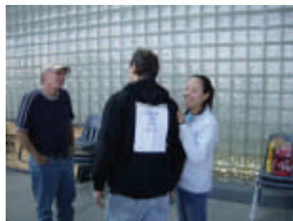
Bar-B-que fundraiser in front of Save-On Foods