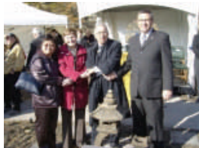
Dedication ceremony regarding A/JTMA at the Edmonton Legislature Grounds, 2008