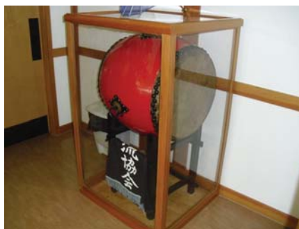
Towada Taiko Drum Dedication Ceremony on December 6th at City Hall

In the year 2001 a delegation from Towada City, Japan came to Lethbridge and met with members of the Lethbridge Twinning Society (LTS). The delegation represented the Towada Association for International Relations (T-AIR). The purpose of the visit was to engage in a twinning agreement between Lethbridge and Towada City.