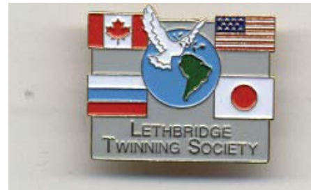
Lethbridge Twinning Society Lapel Pin is available for only $5.00 Cdn.

Offer for sale, the lapel pin (please, see the lapel pin on the right). The cost of the lapel pin is $5.00 CDN (Includes shipping and handling). For ordering, please, e-mail us.