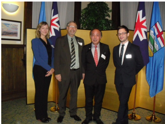
Attendees at the reception