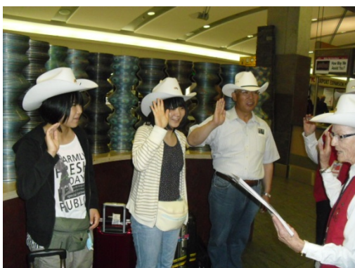
At Calgary International Airport