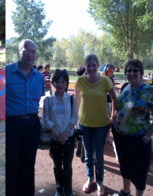
LTS members attend