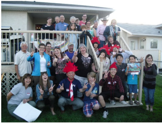
LTS Farewell Bar-B-Que for the Towada City Delegation guests.