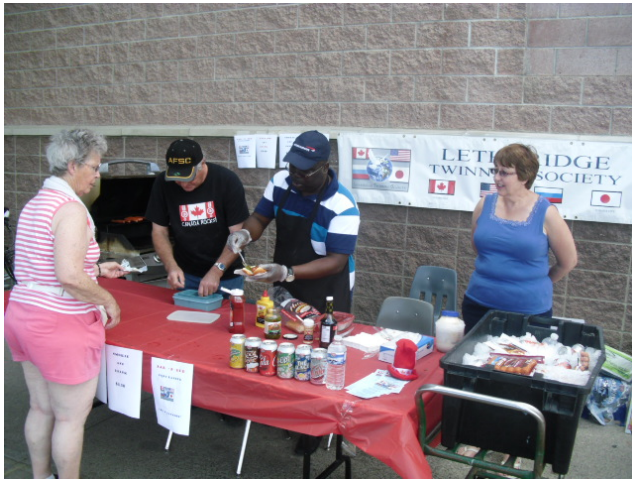
Members of the LTS held a successful Bar-B-Que as a fund raiser event. We served a specialty “Japanese” style hot dog with wasabi, sea weed and daikon radish! “Yummy!”