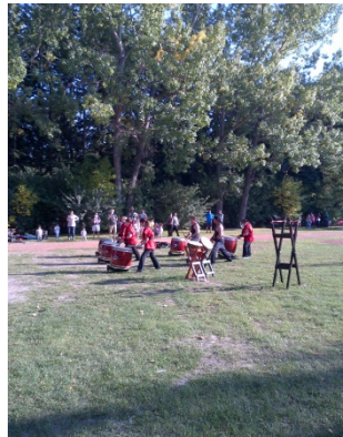
Taiko in the park