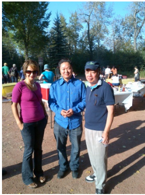
Consul General Fukuda