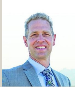
MLA Nathan Neudorf - Lethbridge East -