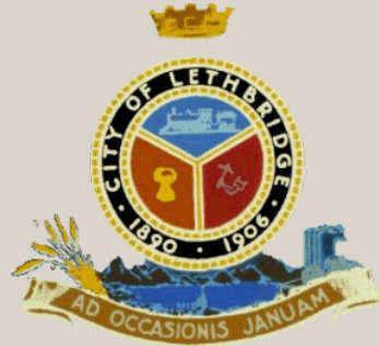
The City of Lethbridge